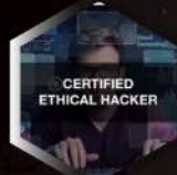
Certified Ethical Hacker Certification v12