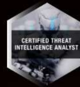
Certified Threat Intelligence Analyst (CTIA)