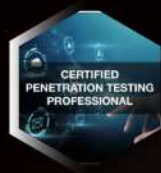
The Certified Penetration Testing Professional (CPT)