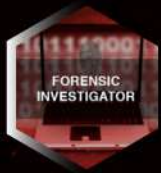
Computer Hacking Forensic Investigator Certification v10