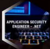
Certified Application Security Engineer (CASE)