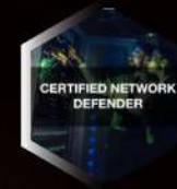
Certified Network Defender Certification v2