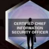
EC-Council's Certified Chief Information Security Officer